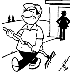
BURY A HATCHET