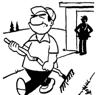
BURY A HATCHET