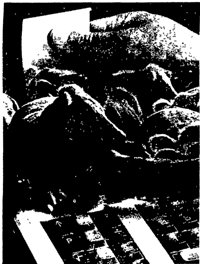
Figure it for yourself.