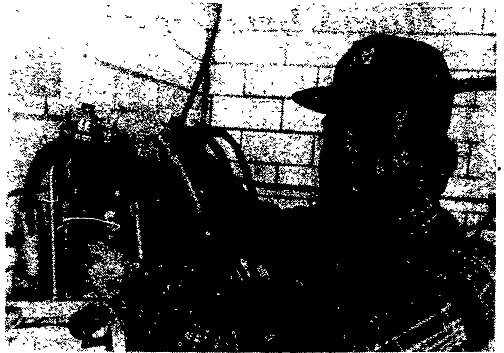
Carl Yoder, like his father, believes in following a path which best suits their operation, rather than follow just any trend.