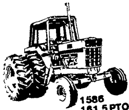
1586 161.5 PTO hp