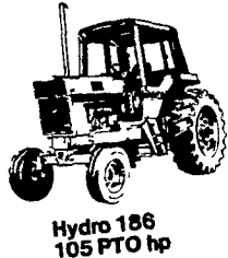
Hydro 186 105 PTO hp