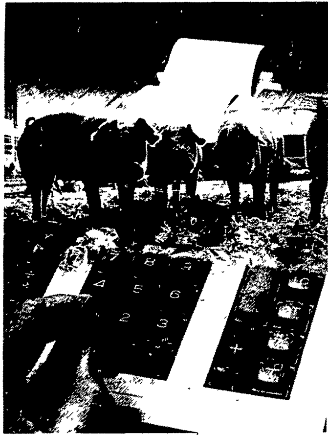
Figure it for yourself.