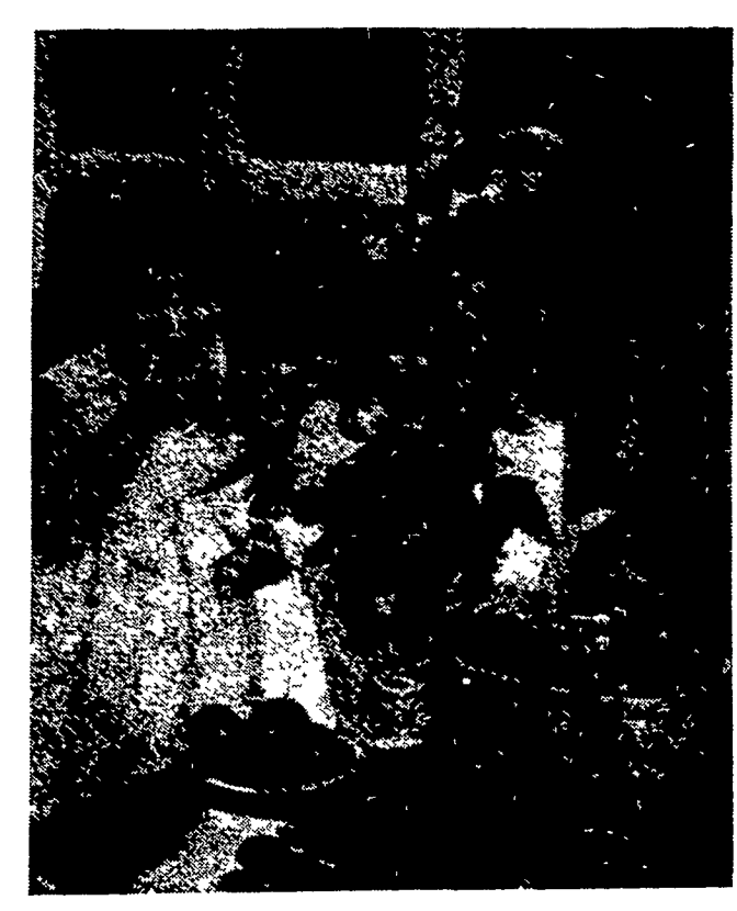
Some varieties of tomatoes will grow indoors over the Winter months.

DOYLESTOWN - With the close of the growing season outdoors in much of the United States, gardening moves inside for the Winter months. Many folks have only a few pots of ivy, philodendron and other foliage plants to decorate in their homes. Attractive and fresh as these are, they are missing a lot of fun, color, variety and yes, even a taste treat if they don't garden from seeds on sunny window sills or under plant lights