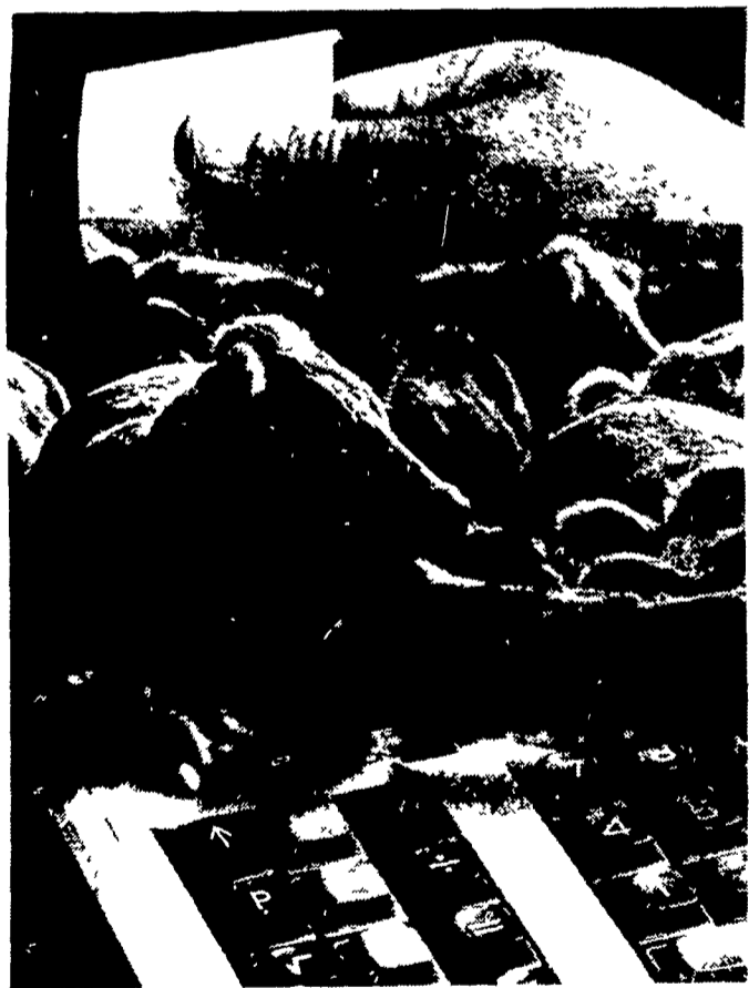
Figure it for yourself.