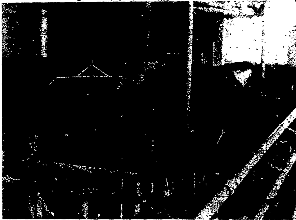
The tie stall barn features a pipeline milker, and stanchions for 100 cows. The Glicks have 100 Holsteins they milk, plus 90 replacement heifers.