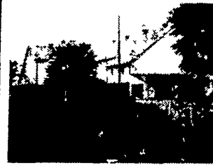
Huge storage area in barn for hay, grain and equipment