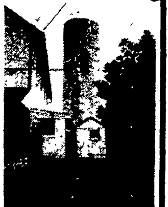
72' Silo equipped with bottom unloader and feeder