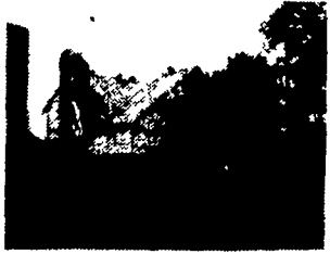
Large bank barn with stanchions to house 48 dairy cows. Has pipeline milker, bulk tank Barn cleaner. Also ample room for calf pens and young stock Ready to go.