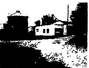
Ear corn storage bins also garage and shop.