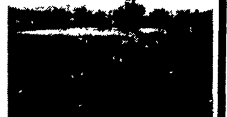
Farm pond located in southeast corner of farm along Trail Road