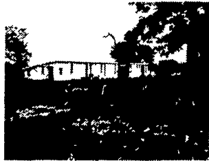
Old brooder house is now used for housing young dairy stock