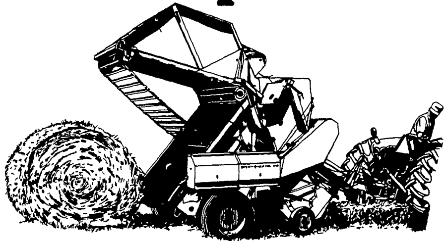
See the 845 AUTO-WRAP