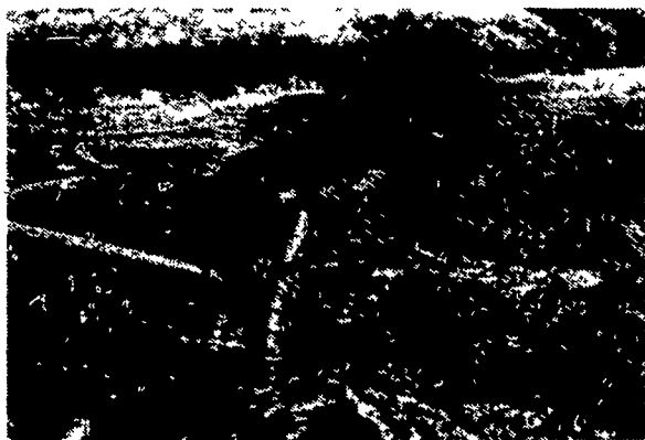
3,000 GALLON SLINGER TANK