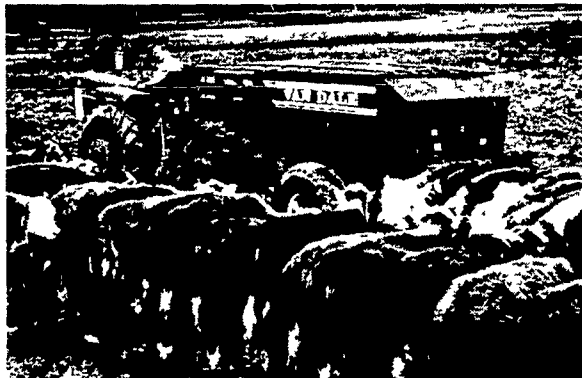
210 CUBIC FT. MIXER, TRAILER MODEL