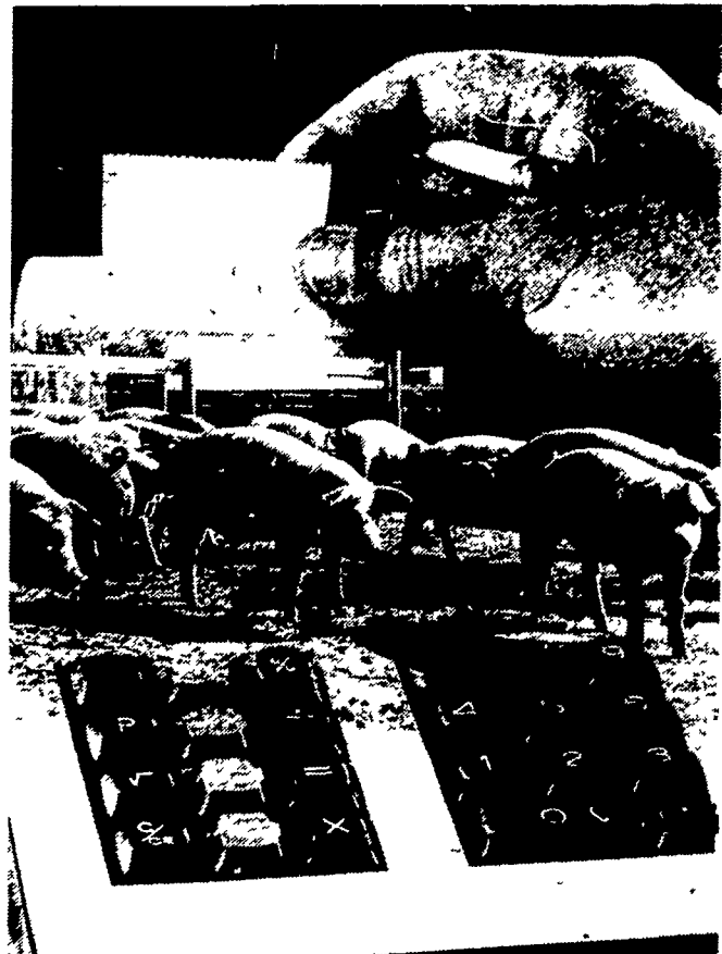
Figure it for yourself. You save money, day after day, with corn-soy and Vigortone.

RD 2, Myerstown 717-949-3755 No Factory Freight Charge