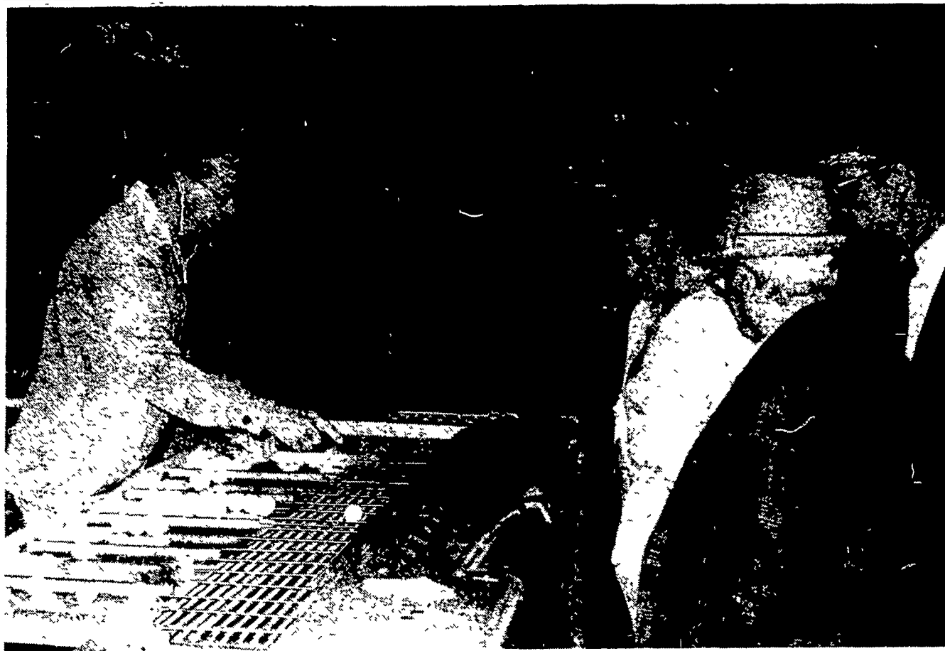
There weren't any chickens to be seen at Park City, but dozens of eggs as well as some grading equipment.