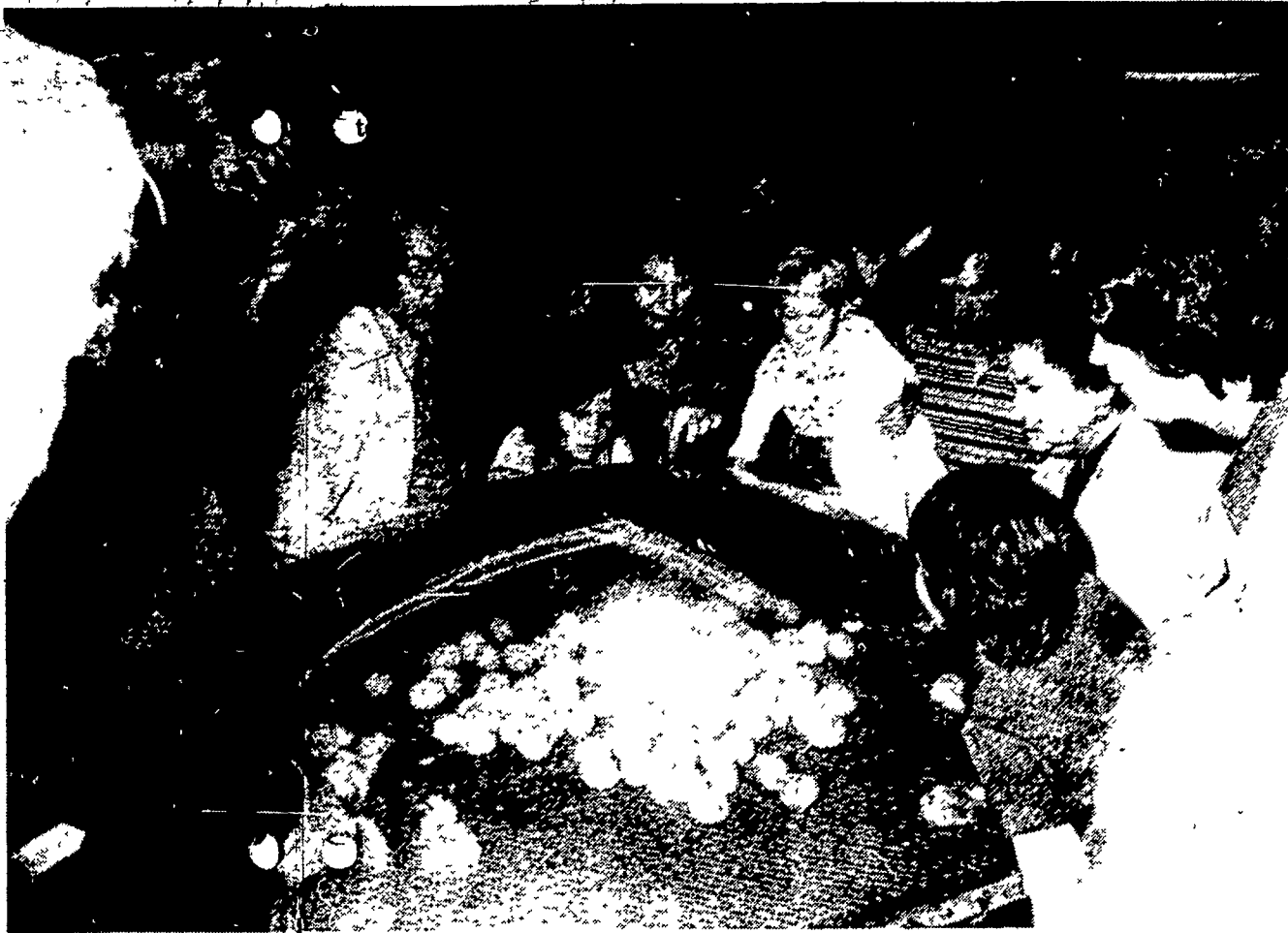
Watching chicks hatch turned out to be one of the most popular displays at Park City.

atured chicks hatching out their eggs. Many of the oppers volunteered to nment on how interesting was for both themselves d their children. tements such as "We joy it," and "It's in- esting" were heard quently. A retired Lancaster County mer commented simply: