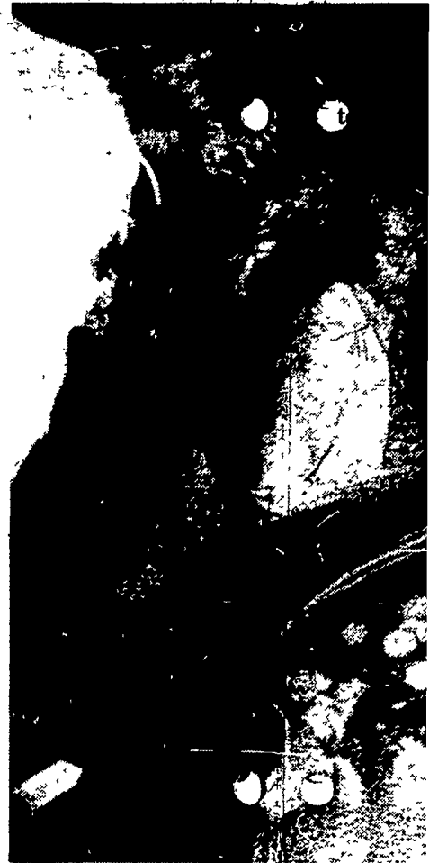
Watching chicks hatch turns

One of the constant biggest attractions throughout the week was one which