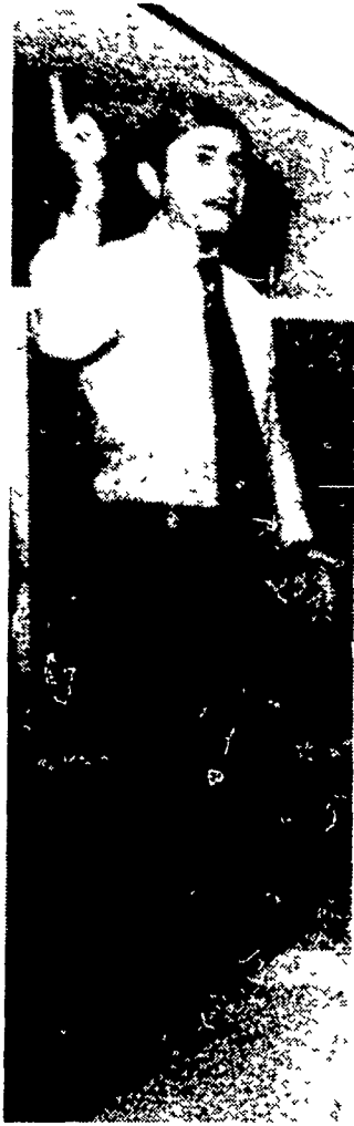
Wade Cadle of the National Grange sings to audiences in sign language.

became interested in the deaf and hard of hearing in 1971. The Department of Women's Activities adopted it as a Grange Health Program.