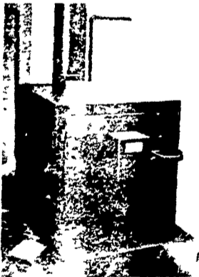
Thermo Control Hot Water Heat Wood Stove 500W

This Thermo Control features automatic thermostat airtight downdraft system firebrick lining. This ingenious heater works in tandem with your existing oil gas electric or solar hot water heating system. Thermo Control 500W which can be installed in about two to four hours comes with the 1/2 inch special A-40 pipe already installed in the firebox. Stoking is done twice a day and your existing system turns on only rarely acting merely as a backup unit. The saving can range from 50 to 100 - on expensive fuels. Available with optional warm air hood domestic hot water piping. Overall dimensions 34 inches long 24 inches wide 32 inches high. Firebox dimensions 34 inches long, 24 inches wide 24 inches high. Firebox door measures 18 inches high by 21 inches wide for easy loading. If your present hot water system will heat your home so will the Thermo Control Hot Water Heat Wood Stove but without burning expensive fuels. Shipping weight is approximately 455 pounds.