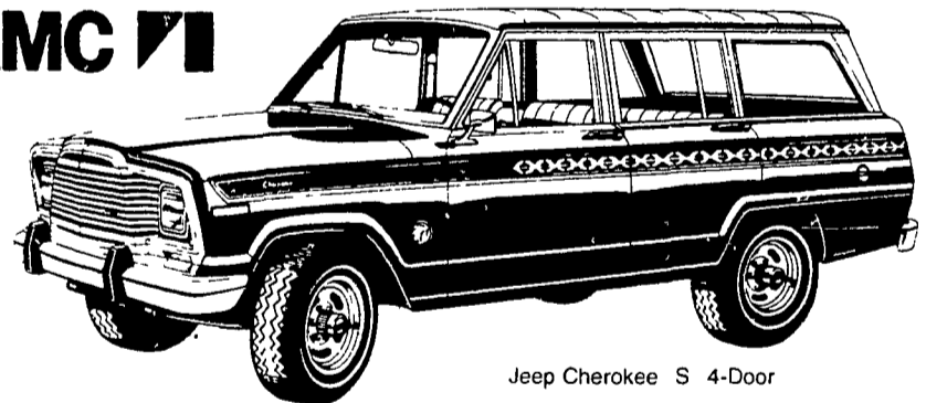
Jeep Cherokee S 4-Door