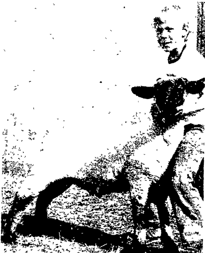
Andrew Haas exhibited the top market lamb at the Oley Fair.