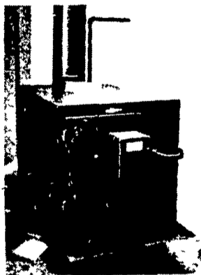
THERMO CONTROL "HOT WATER HEAT" WOOD STOVE Model 500W

This Thermo Control features automatic thermostat airtight downdraft system firebrick lining. This ingenious heater works in tandem with your existing oil gas electric or solar hot water heating system. Thermo Control 500W which can be installed in about two to four hours. Comes with the 3/4 inch special A 40 pipe already installed in the firebox. Stoking is done twice a day and your existing system turns on only rarely acting merely as a backup unit. The saving can range from 50 to 100% on expensive fuels. Available with optional warm air hood domestic hot water piping. Overall dimensions 34 inches long 24 inches wide 32 inches high. Firebox dimensions 34 inches long 24 inches wide 24 inches high. Firebox door measures 18 inches high by 21 inches wide for easy loading. If your present hot water system will heat your home so will the Thermo Control Hot Water Heat Wood Stove but without burning expensive fuels. Shipping weight is approximately 455 pounds.