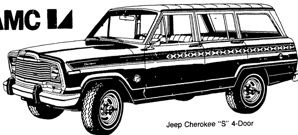
Jeep Cherokee "S" 4-Door