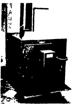
THERMO CONTROL "HOT WATER HEAT WOOD STOVE Model 500W"

This Thermo Control features automatic thermostat airtight downdraft system firebrick lining. This ingenious heater works in tandem with your existing oil gas electric or solar hot water heating system. Thermo Control 500W which can be installed in about two to four hours. Comes with the 4 inch special A 40 pipe already installed in the firebox. Stoking is done twice a day and your existing system turns on only rarely acting merely as a backup unit. The saving can range from 50 to 100 on expensive fuels. Available with optional warm air hood domestic hot water piping. Overall dimensions 34 inches long 24 inches wide 32 inches high. Firebox dimensions 34 inches long 24 inches wide 24 inches high. Firebox door measures 18 inches high by 21 inches wide for easy loading. If your present hot water system will heat your home so will the Thermo Control Hot Water Heat Wood Stove but without burning expensive fuels. Shipping weight is approximately 455 pounds.