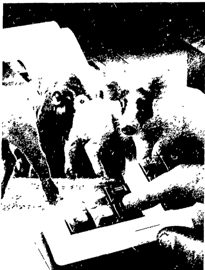
Figure it for yourself.

You get them on feed at half the cost with our pre-starter.