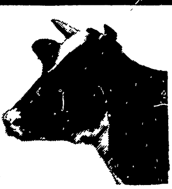
Mount Joy, PA 17552