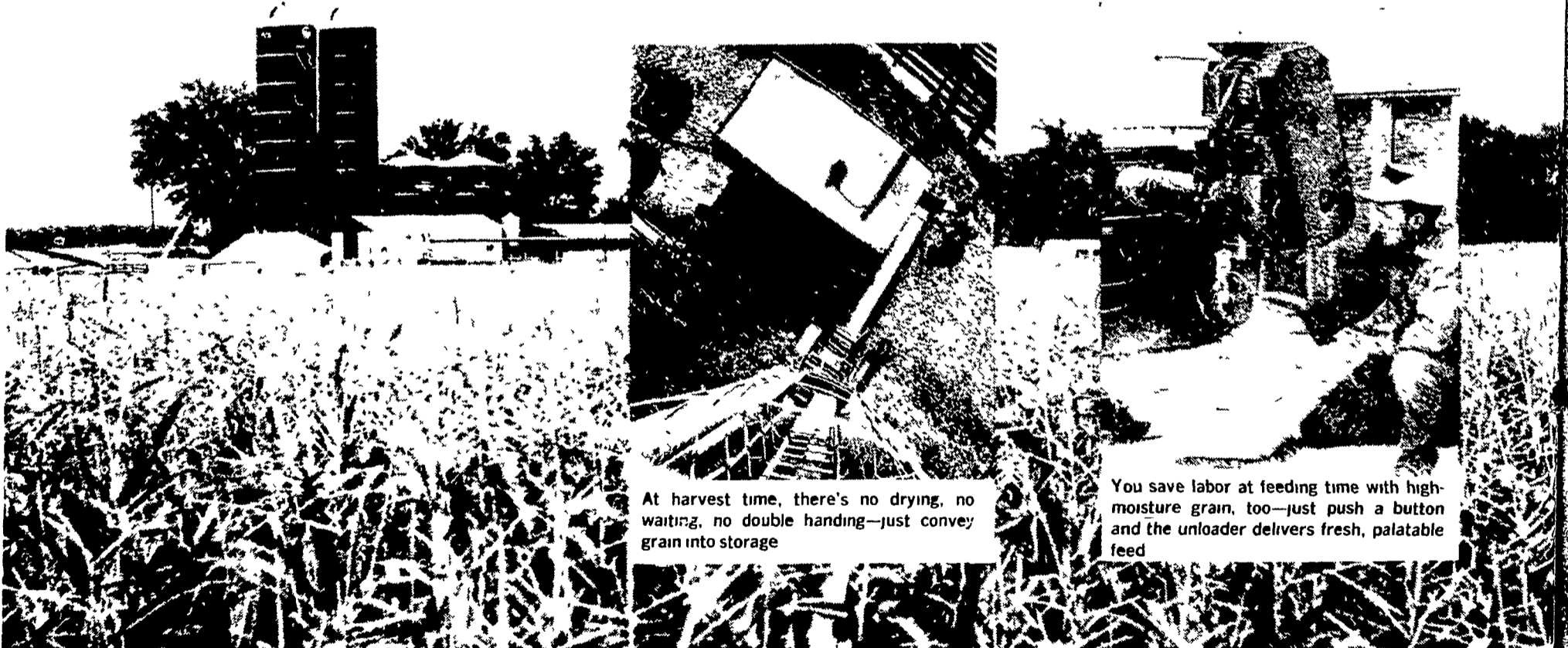
At harvest time, there's no drying, no waiting, no double handling—just convey grain into storage