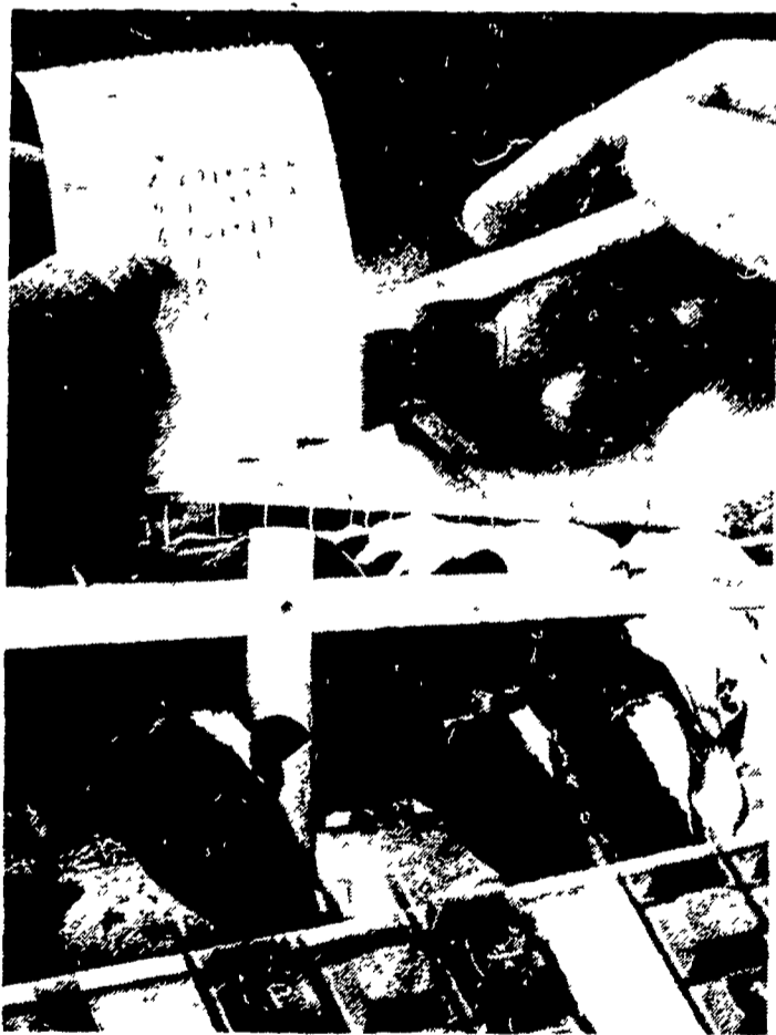
Figure it for yourself.