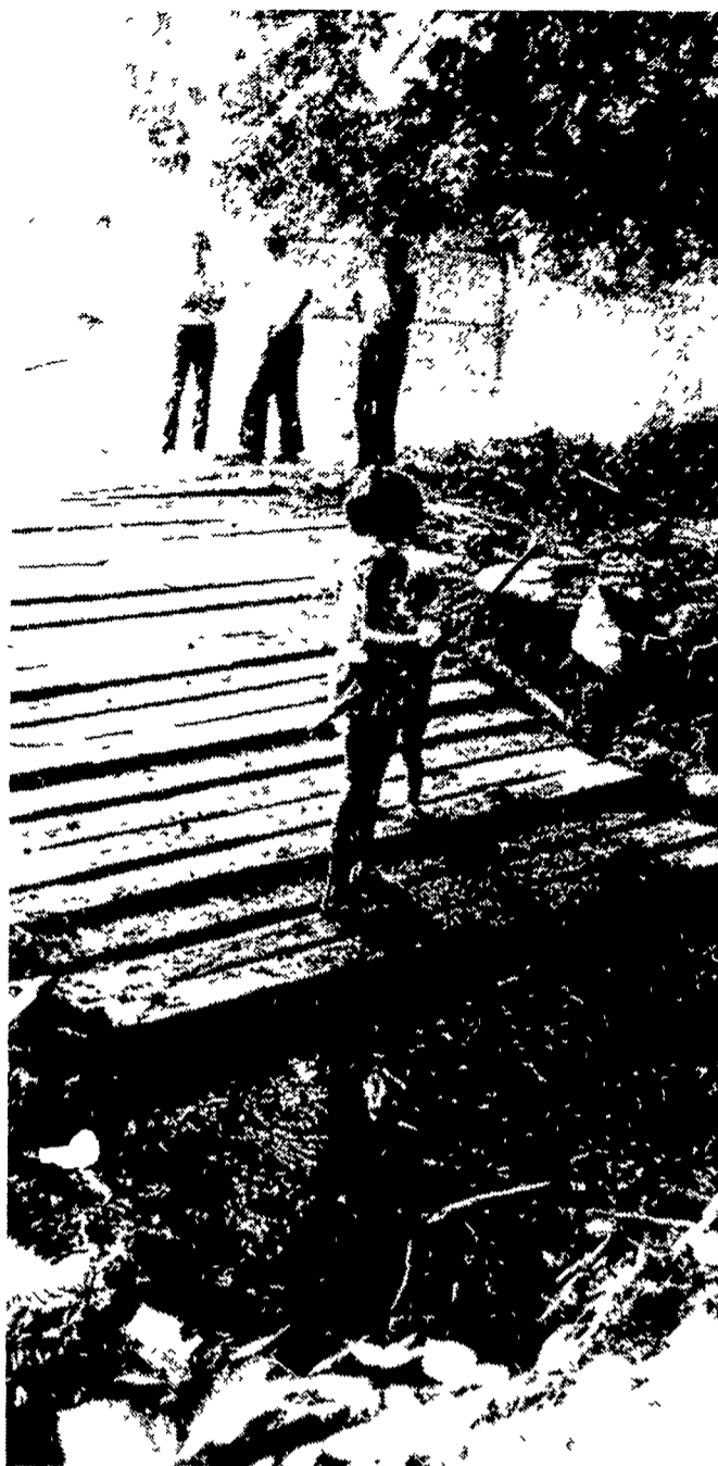
This arrangement of railroad ties sloping down to a small stream is designed to keep cattle from polluting the water.