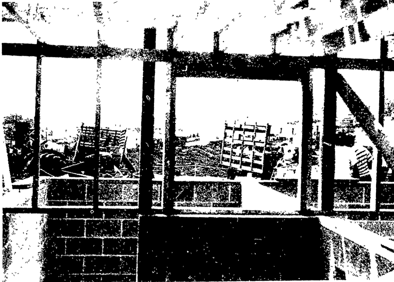
A new hog barn was being constructed as bulldozers dug a pond and thousands of visitors toured the area in wagons.