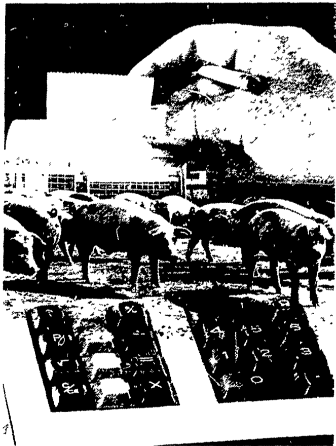
Figure it for yourself.