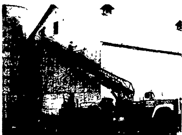
HYDRAULIC AERIAL EQUIPMENT