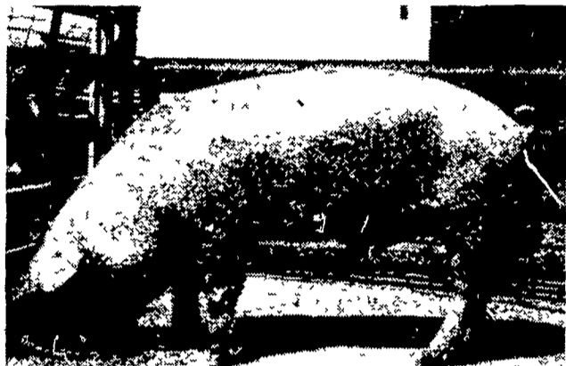
The top gaining Landrace boar is owned by Donald L. Lake, Lake's Landrace Farm, Big Cove Tannery R2 and had an Average Daily Gain of 2.08 pounds per day.