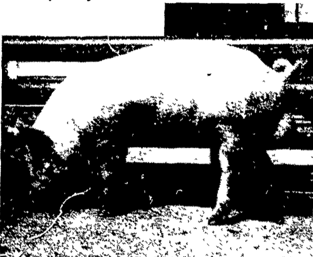
The top gaining Yorkshire is owned by Brooks End Farm, Beavertown. He had an Average Daily Gain of 2.52 lbs. per day. He also had a feed conversion of 2.55 lbs. of feed to produce a pound of gain which is tops over all breeds.