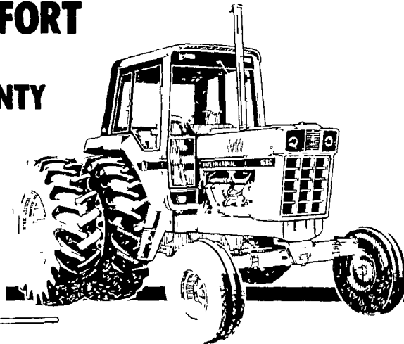
International® 1586 Tractor

SPECIAL PRICE IHC MODEL 35 HYDRAULIC DRIVE RAKE and TEDDER