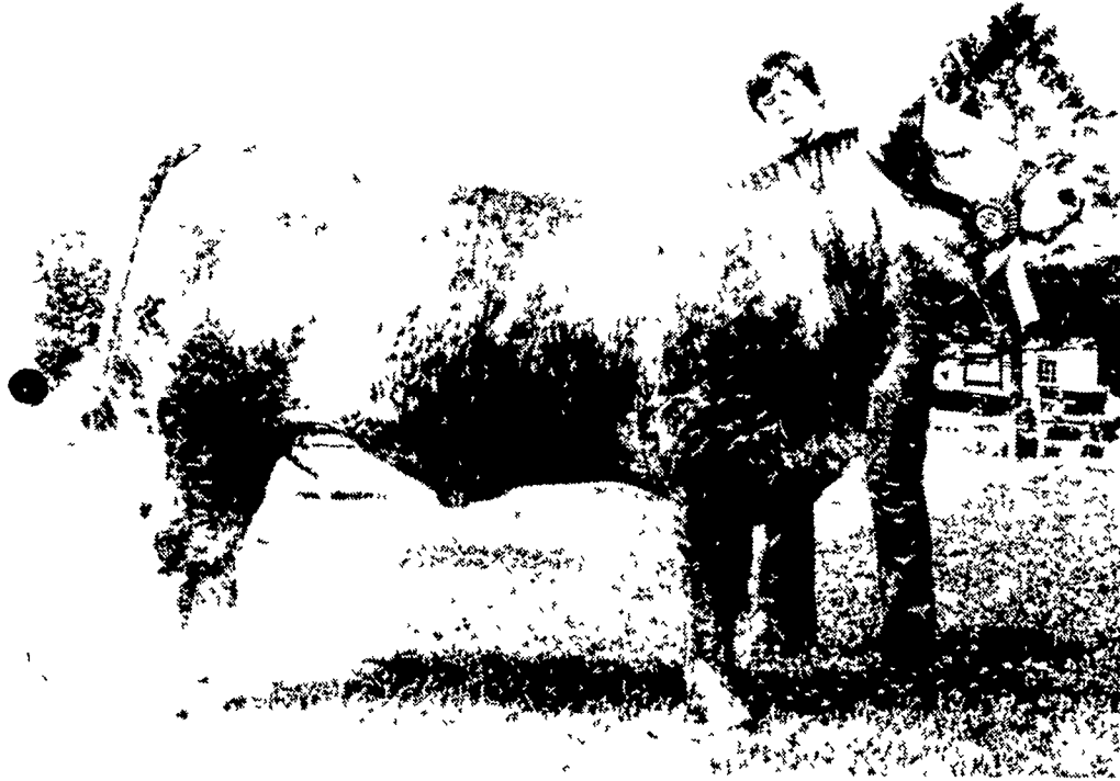
Bill Wylie poses with his grand champion Simmental crossbred at the 11th annual Chester County Summer 4-H beef show.

Andora juniper, a low growing plant, is the preferred host of the juniper midge, but all prostrate varieties and some upright varieties of the juniper are also susceptible.