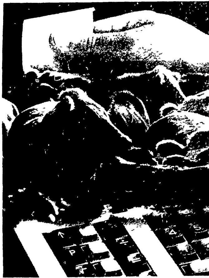
Figure it for yourself.