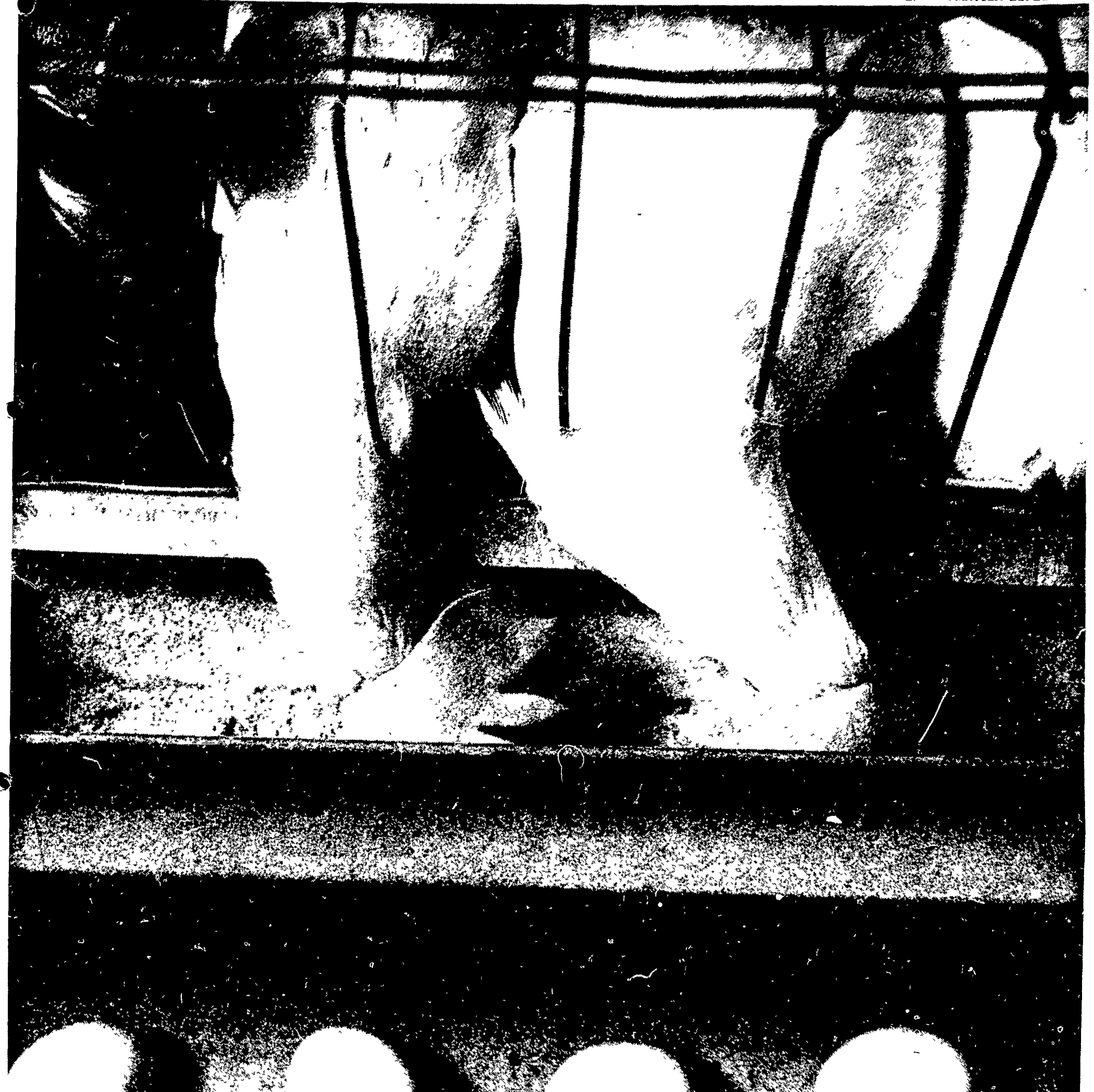
Lancaster Farming, Saturday, July 15, 1978-5