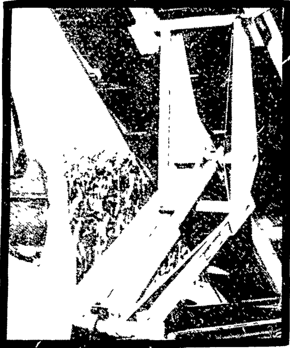
RIGID LIFT 100

RECOMMENDED FOR SINGLE AXLE TRUCKS WITH 10 TO 16 FT. TRUCK BODIES.