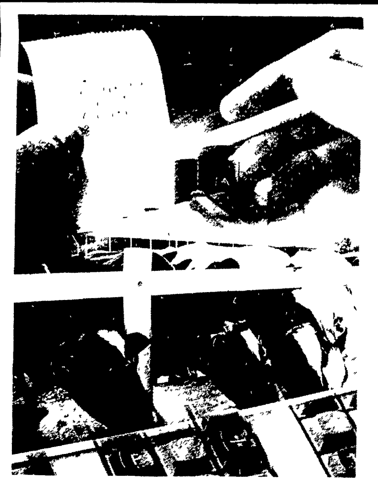
Figure it for yourself.