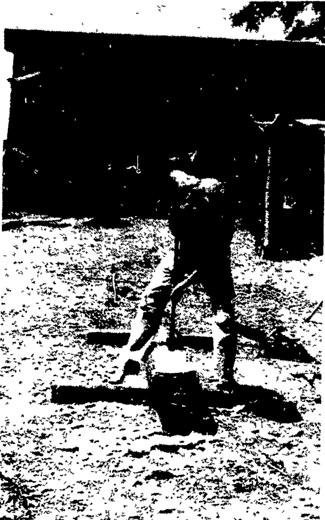
Log-hewing will be part of the Agricultural Americana Folk Festival to be held from July 22 to the 30 near Harrisburg.

Other demonstrations include butter-making, applebutter-making, turkey shooting, panning for gold, flintlock demonstrations, and more. The children's activities include a pie-eating contest, spelling bee, corn-shelling contest, peanut scramble, hay wagon rides, and rooster catch. There will be fun for all at the Agricultural Americana Folk Festival, July 22 through 30.