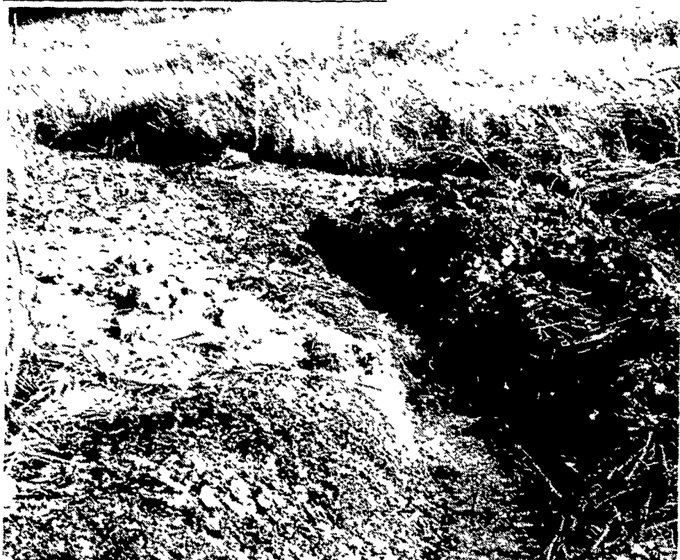
Soil erosion may have been the worst problem of this week's storms, which left Lancaster County hardest hit.