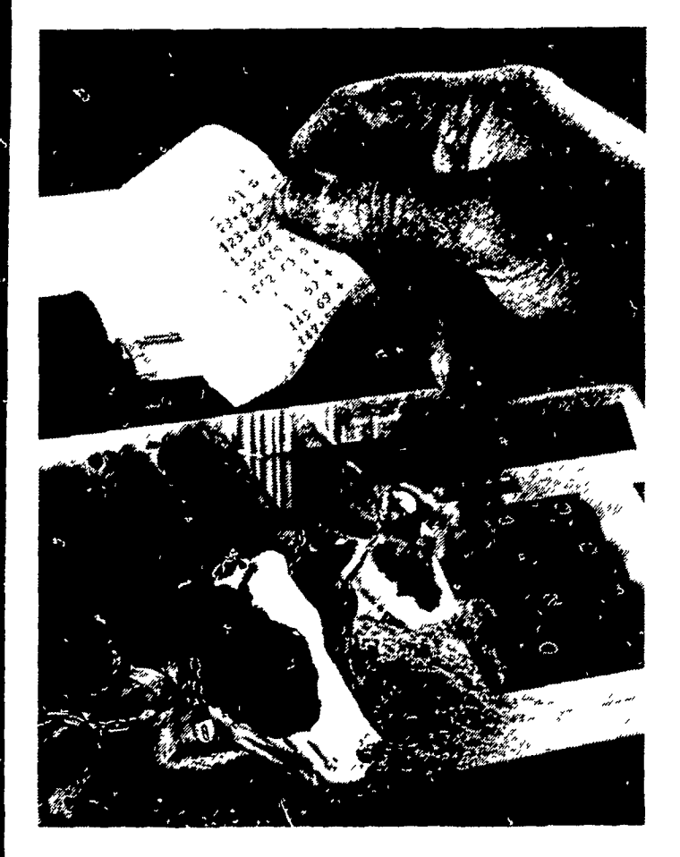
Figure it for yourself.