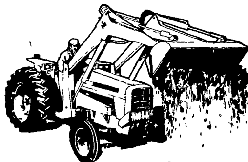
SEE ON DISPLAY ▶ THE NEW IH 484 TRACTOR