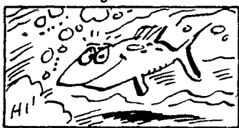
Fish have been seen at ocean depths of almost 7 miles.