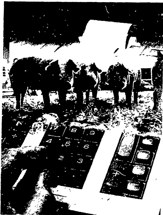
Figure it for yourself.