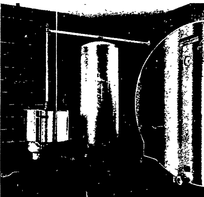
HOW MUCH WATER CAN BE GENERATED?

There are many variables, so this question cannot be answered directly, however, a rule of thumb is that a Fre-Heater operating on 60° F well water will produce a volume of 145° F water similar to the amount of milk produced during a milking