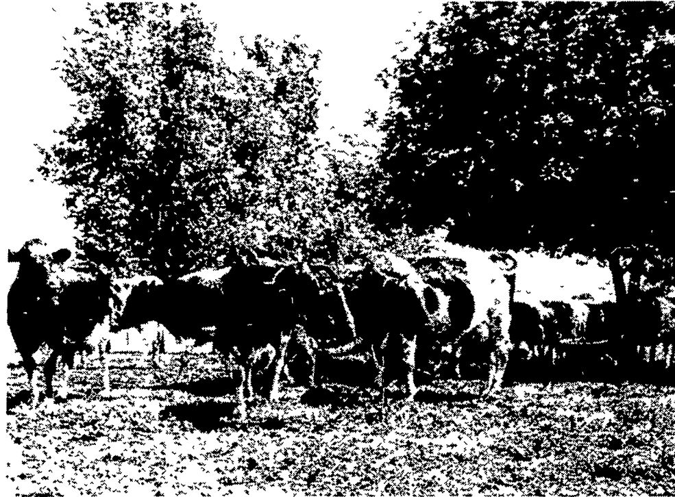
The dairy cow as we know her today was unheard of less than 100 years ago. Man has made her what she is through specific breeding and feeding programs.