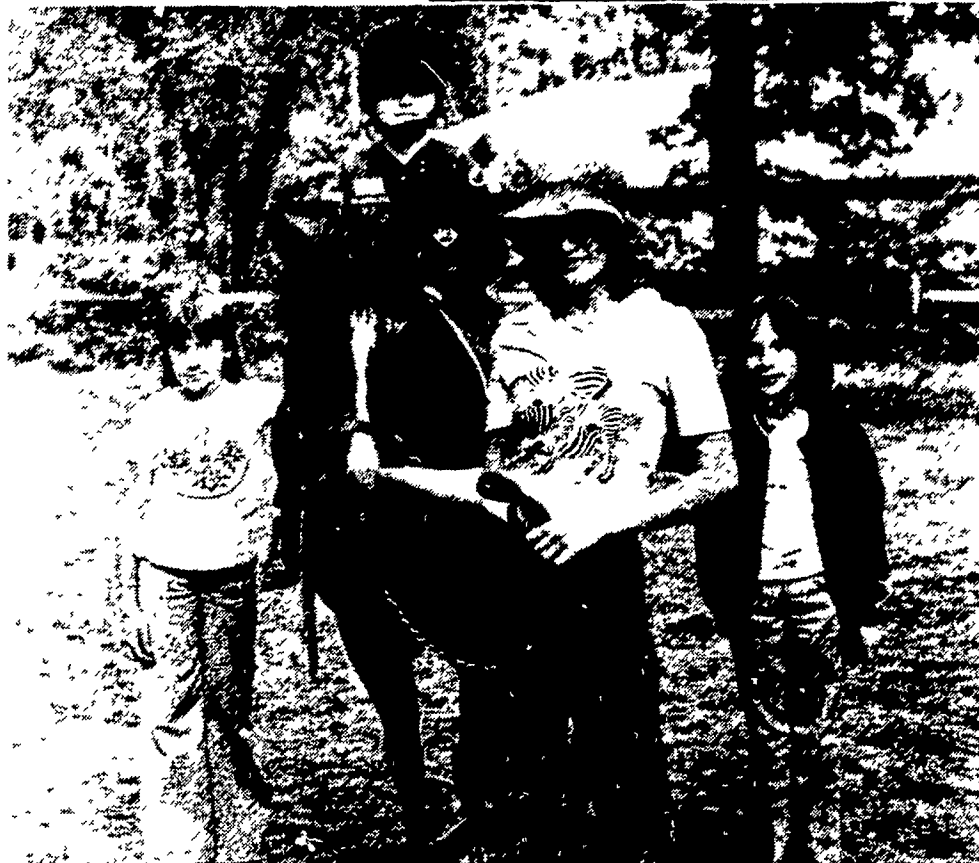
Three Rough Rider 4-H'ers plus one pony and one eager rider add up to a great combination for the riding class.

For further information, please call Tom Welsh, East Berlin, 717-259-9685.