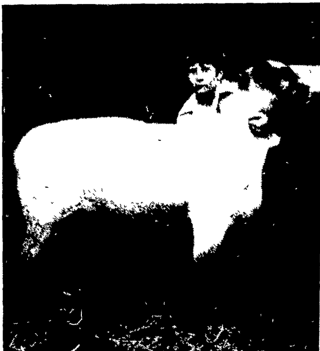
The Menhennett Shropshire Ram 563 topped the Shropshires with an index of 110. He sold for $320.

All breeds represented in the test and sale showed healthy increases in sale prices with the exception of Southdowns. Prices were generally 20 per cent better than last year. Breed averages were as follows: Cheviots $100, Dorsets $241, Hampshires $190, Shropshires $195, Merions $80, Southdowns $67.50, Suffolks $294, and Oxfords $170.