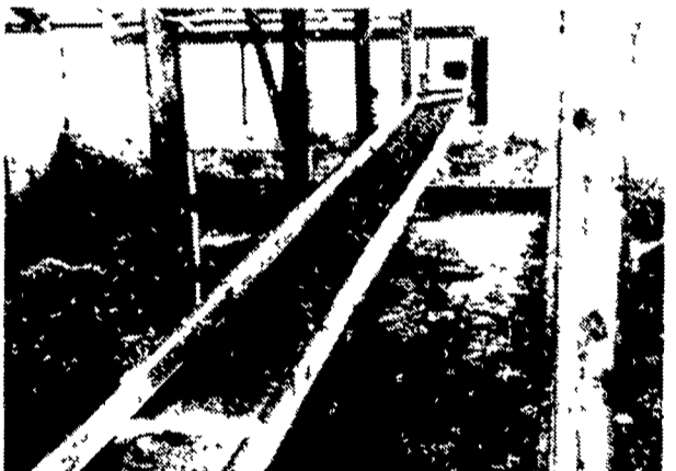
Belt Feeders can be hung on left or right side. Distance between side posts should not exceed 10 ft to 12 ft