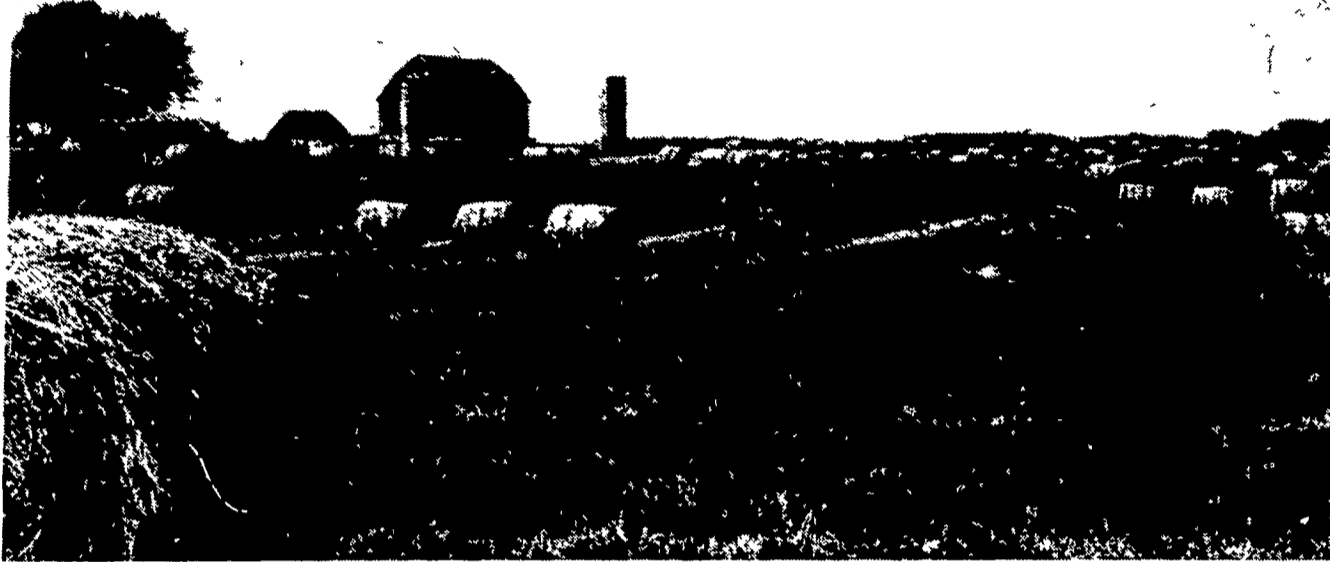
With hay commanding record-high prices, farmers are paying more and more attention to management practices and hay-making methods.