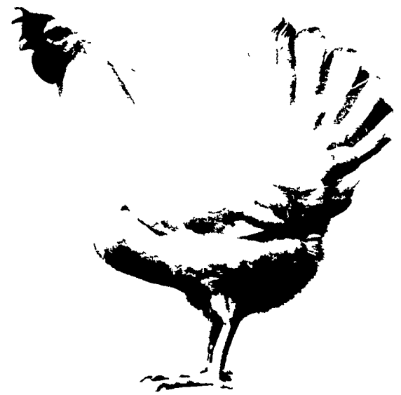
BABCOCK B-300V 1st CAGE AND FLOOR.

If you've been buying chicks based on Random Sample performance, isn't it time to buy today's winner -- the Babcock B-300V.